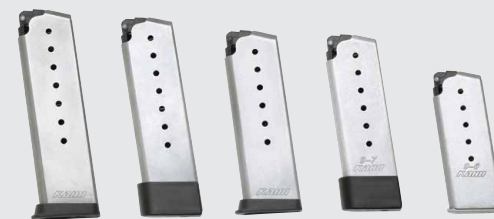
.380 ACP, 9mm, .40 S&W, .45 ACP Magazines