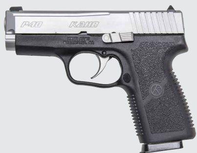
P40 ® KP4043