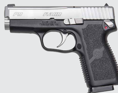
P9 MA COMPLIANT KP9193