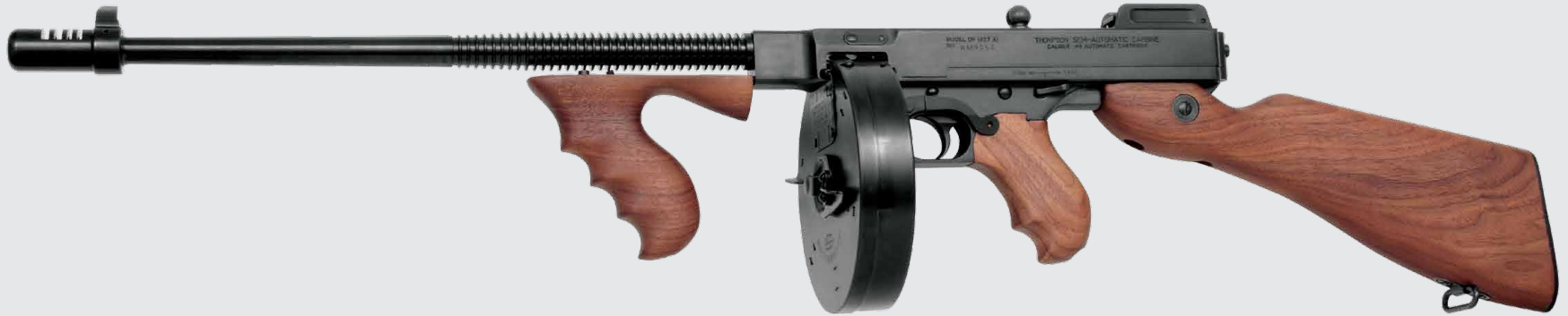
• Shown T150D