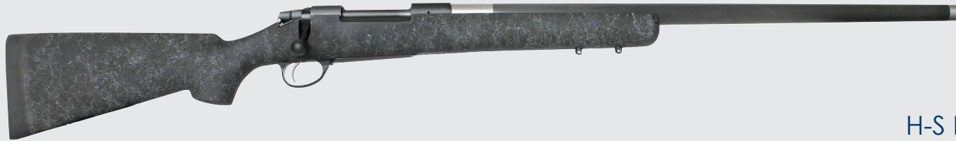
Shown Remington® Long Action with 26" Sport Taper Barrel

Our exclusive Mountain Eagle™ Magnum Lite® Graphite Barrel Centerfire Rifle has the extraordinary advantages of our Magnum Lite® graphite barrel. It features a blueprinted Remington® 700 action with an adjustable trigger and either the H-S Precision or Hogue® OverMolded™ stock. Each one is custom built to your specifications. Call MRI Customer Service 218-746-3459 to order a rifle to meet and exceed your performance expectations.