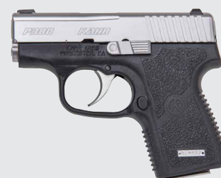
P380 ® KP3833