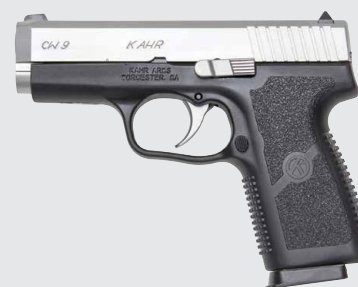
CW9 ® CW9093