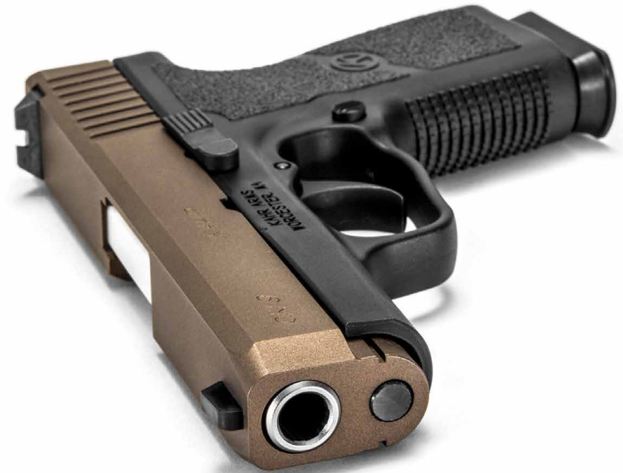
• Shown Cerakote Burnt Bronze CW9093BB