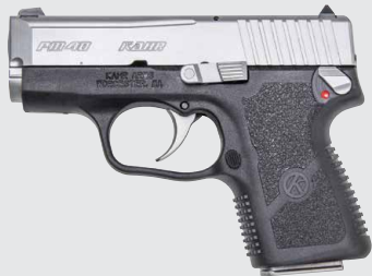
PM40 ® MA COMPLIANT PM4143