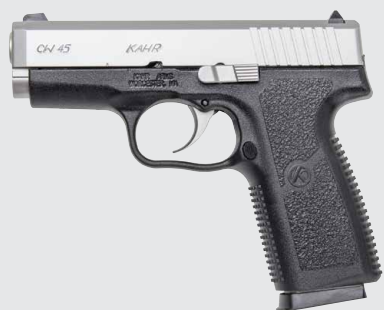
CW45 ® CW4543