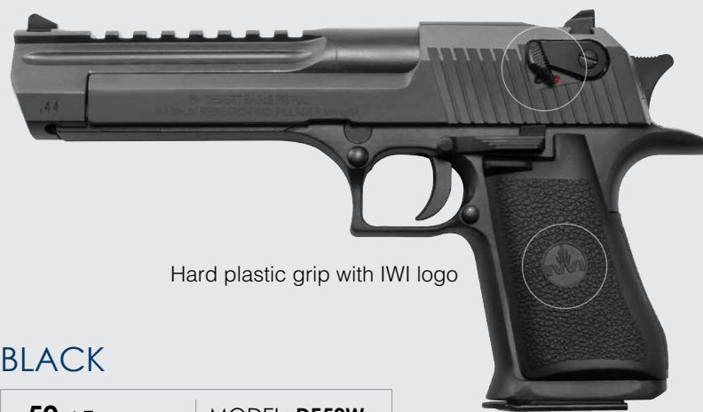
Hard plastic grip with IWI logo