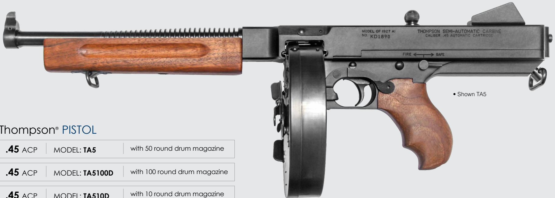
• Shown TA5