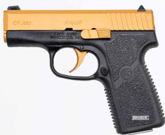
CT380 ® CT3833CG