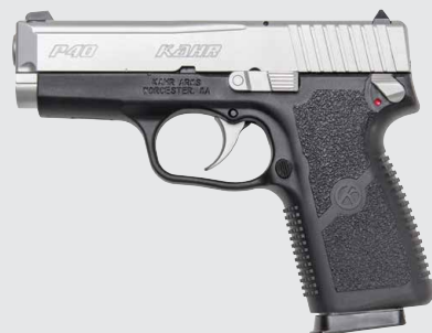
P40 ® MA COMPLIANT KP4143