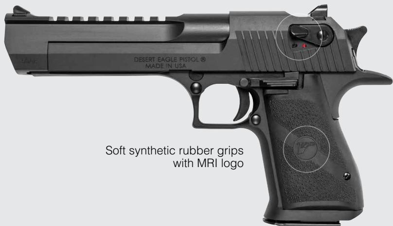
Soft synthetic rubber grips with MRI logo