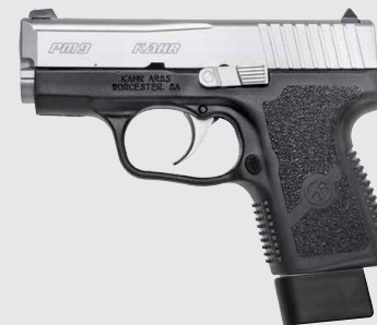
PM9 ® PM9093