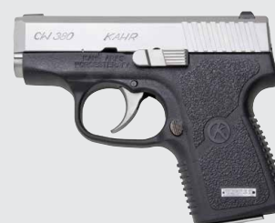
CW380 ® CW3833