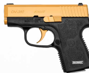
CW380 ® CW3833CG