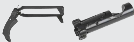
DESERT EAGLE MARK XIX PISTOLS Desert Eagle .50 AE