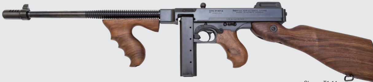
• Shown T1-14