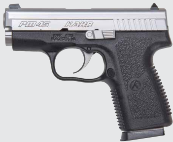
PM45 ® PM4543