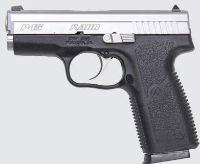
P45 ® KP4543