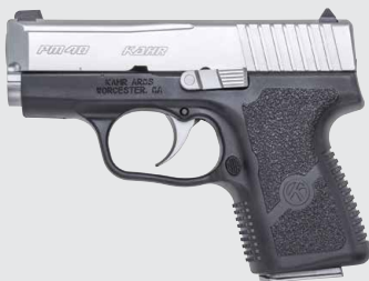
PM40 ® PM4043