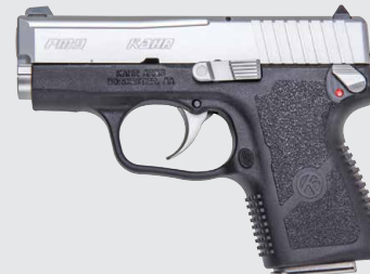
PM9 ® MA COMPLIANT PM9193