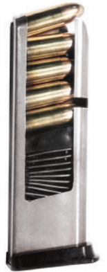
Shown cut out magazine

The Kahr magazine tube is constructed of corrosive resistant 400 series Stainless Steel and heat treated to 50 Rockwell for durability. Plasma-welding the stamping to form the magazine tube gives a smooth interior surface for the "ammunition stack" to rise and feed, and creates an "unbreakable" seam. Furthermore, tumbling the magazine in the finishing process provides a smooth, consistent burr-free surface. There are no sharp edges on which to cut yourself.