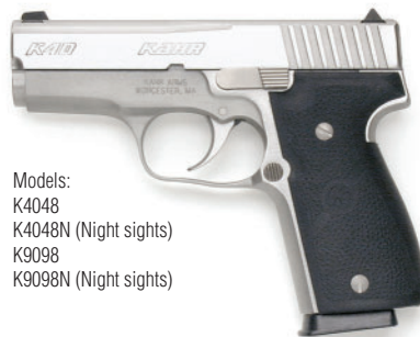
Models: K4048 K4048N (Night sights) K9098 K9098N (Night sights)

The KP4544, KP4044, KP9094 and KP3833 matte stainless slides are blackened using an ultra hard and super thin coating. This coating has been used successfully in the knife industry to protect blades from corrosion and scratches.