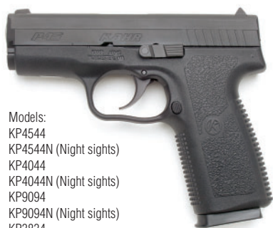
Models: KP4544 KP4544N (Night sights) KP4044 KP4044N (Night sights) KP9094 KP9094N (Night sights) KP3834 KP3834N (Night sights)